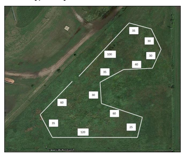
Sunday, 600 yards